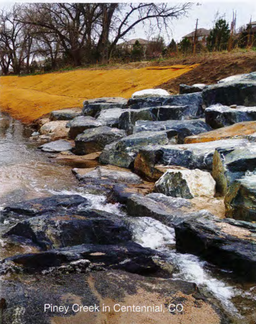
Piney Creek in Centennial, CO