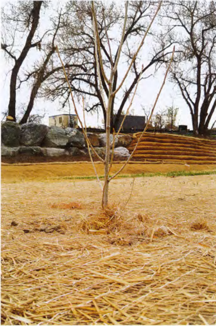
Near Piney Creek

really care if some weeds eventually move into the site because no one sees it. But on a created landscape, it's high visibility and this is noticeable."