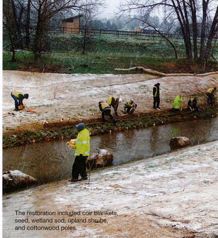
The restoration included coir blankets, seed, wetland sod, upland shrubs, and cottonwood poles.

“This is a naturally occurring fungus that is so beneficial to plants. When the symbiotic relationship forms and the plant produces sugars, it sends signals to the fungus, saying, ‘I need more nitrogen,’ so the spore creates filaments that